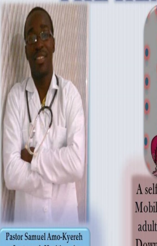
Lecturer & Health and Wellness Consultant

A self designed religious - medical Mobile App meant to assist young adults deal with daily life's issues. Download your copy from Google Store Now... It's FREE!!!